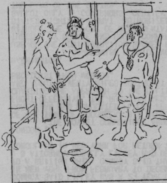
"MEET MY BOY FRIEND OFF THE " ABBOT"