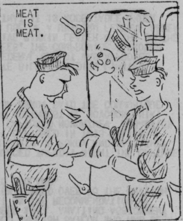
"WHAT JUST FOR A PIECE OF BEEF! YOU SHOULD HAVE HELD OUT AT LEAST FOR A HAM.